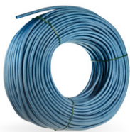
Blue glass fiber hose \varnothing 5 or 6 mm