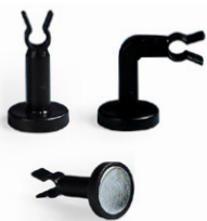
Support for SPAGLESS fiber hose