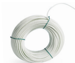
Standard glass fiber hose \varnothing 5, 6 or 8 mm